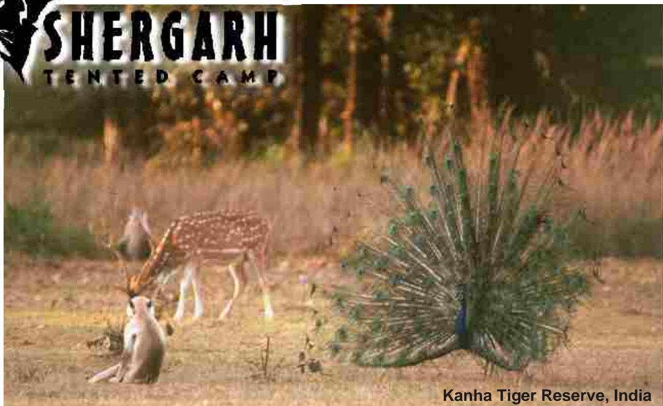
Kanha Tiger Reserve, India

S et amongst woodland surrounding a large waterhole at the centre of its grounds, Shergarh is a new camp providing tented accommodation, traditional home-cooked food and personalised wildlife activities, in a warm, relaxed environment.